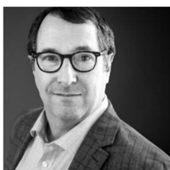
President and CEO of Accord and a non-independent director