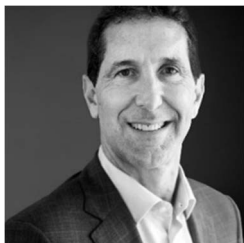
Independent director and Board Chair